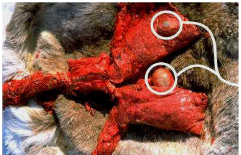
Hydatid cysts infecting moose or caribou lungs.

My first Outdoorsman article on hydatid disease caused by the tiny Echinococcus granulosus tapeworm was published nearly 40 years ago. Back then we had many readers in Alaska and northern Canada where the cysts were present in moose and caribou and my article included statistics on the number of reported human deaths from these cysts over a 50-year period, and the decline in deaths once outdoorsmen learned what precautions were necessary to prevent humans from being infected.